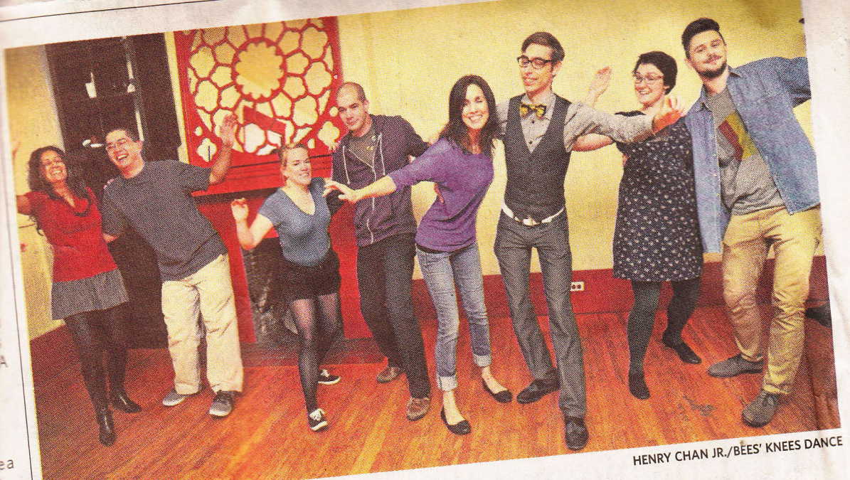
Students at Bees' Knees Dance show their stuff during a swing dance lesson.